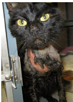
Karma Before Surgery

They said this about Nyles: "Nyles is doing great! He is now 8.5 lbs! I think, however, that no one told him he was a cat! He comes to us when he is called and talks to us often using many different sounds. We love him so much. Thank you for taking such good care of him and saving his life, NRHS. You are the best!"