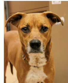
All American Beauty