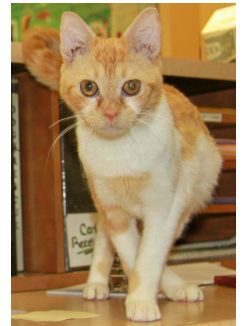
Nyles Going Home