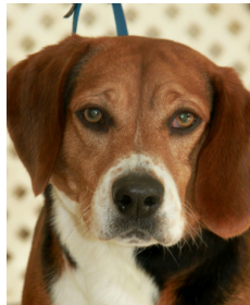
Lovable Hound Mix