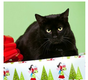
Karma Going Home