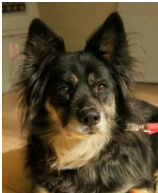
Smartest Dog Ever